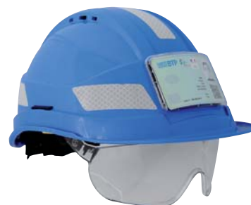
KARA with options: goggles, rigid badge holder and retro-reflective stickers