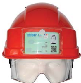
IRIS 2 badge holder version